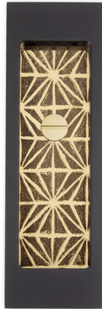
SHOWN IN US19LL.M with Etched Inlay