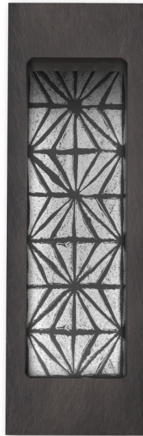
SHOWN IN TN with Etched Inlay