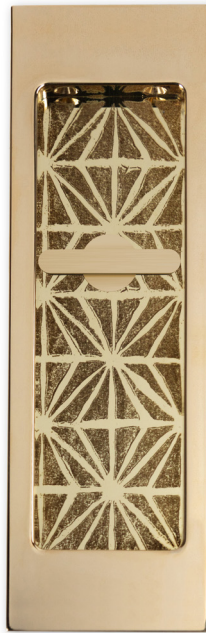
SHOWN IN US3 with Etched Inlay